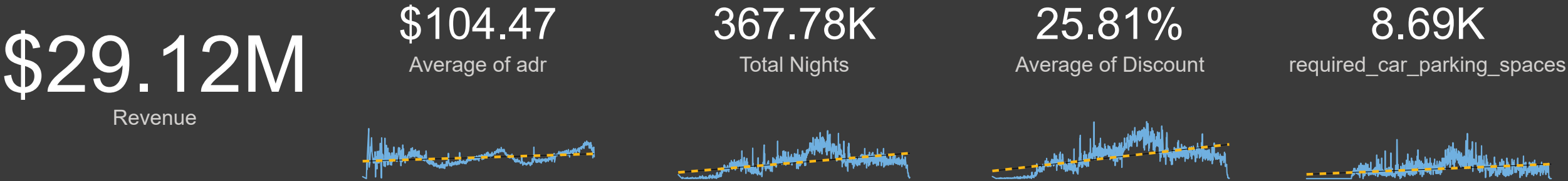
Revenue by reservation_status_date and hotel